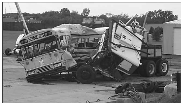
Figure 2 Post-Test Photograph of Side Impact Crash Test

Pre- and post-test configurations are shown in Figures 1 and 2, respectively. Two 50th percentile male side impact dummies (SIDs), along with the Hybrid III 5th percentile female and 6-year-old frontal dummies, were positioned in selected seating locations in the side impact test. One Hybrid II 50 th percentile male dummy was located at the direct point of impact to determine “survivability” within the impact zone.