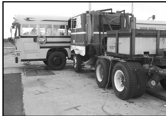
Figure 1 Pre-Test Photograph of Side Impact School Bus Crash Configuration

truck, at 72 kph (45 mph) and 90°, into the side of a transit style school bus (Class D).