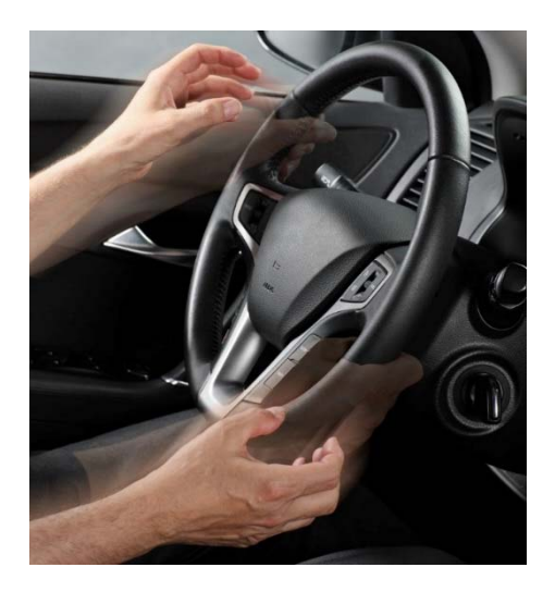
Figure 1. "Hands off" detection scenario

smooth roads, especially at low speeds. IEE developed a capacitive "Hands Off Detection" (HOD) sensor integrated into the steering wheel rim to overcome those concerns. This HOD sensor allows the vehicle to detect precisely if the driver has his hands on the steering wheel, and if he does not, to initiate an appropriate warning cascade. The IEE HOD sensor has been in production since the end of 2013.