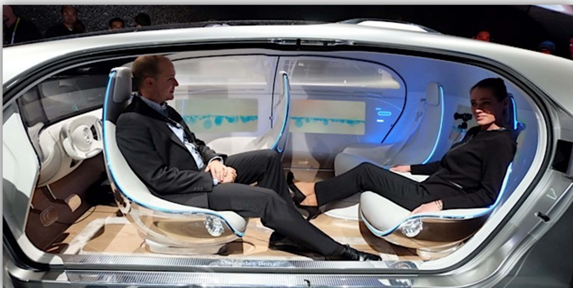
Figure 3. Mercedes-Benz F015 - New interior concepts for automated driving [2]

This progress has an impact on seating configurations in future vehicles. For one thing occupants are expected to be seated as they would in a conventional taxi cab. Thus the safety systems would be comparable to those in current vehicles. Then in the continuing evolution of automated driving, ADS-operated vehicles will feature new interior concepts including seats that can be rotated 180° from conventional positions and thus allow living room-style seating, as demonstrated by Mercedes-Benz within the research car F015 [1], depicted below. These interior concepts are creating new options for interior stylists, but are also creating new challenges for safety engineers as they develop safety concepts for the future.